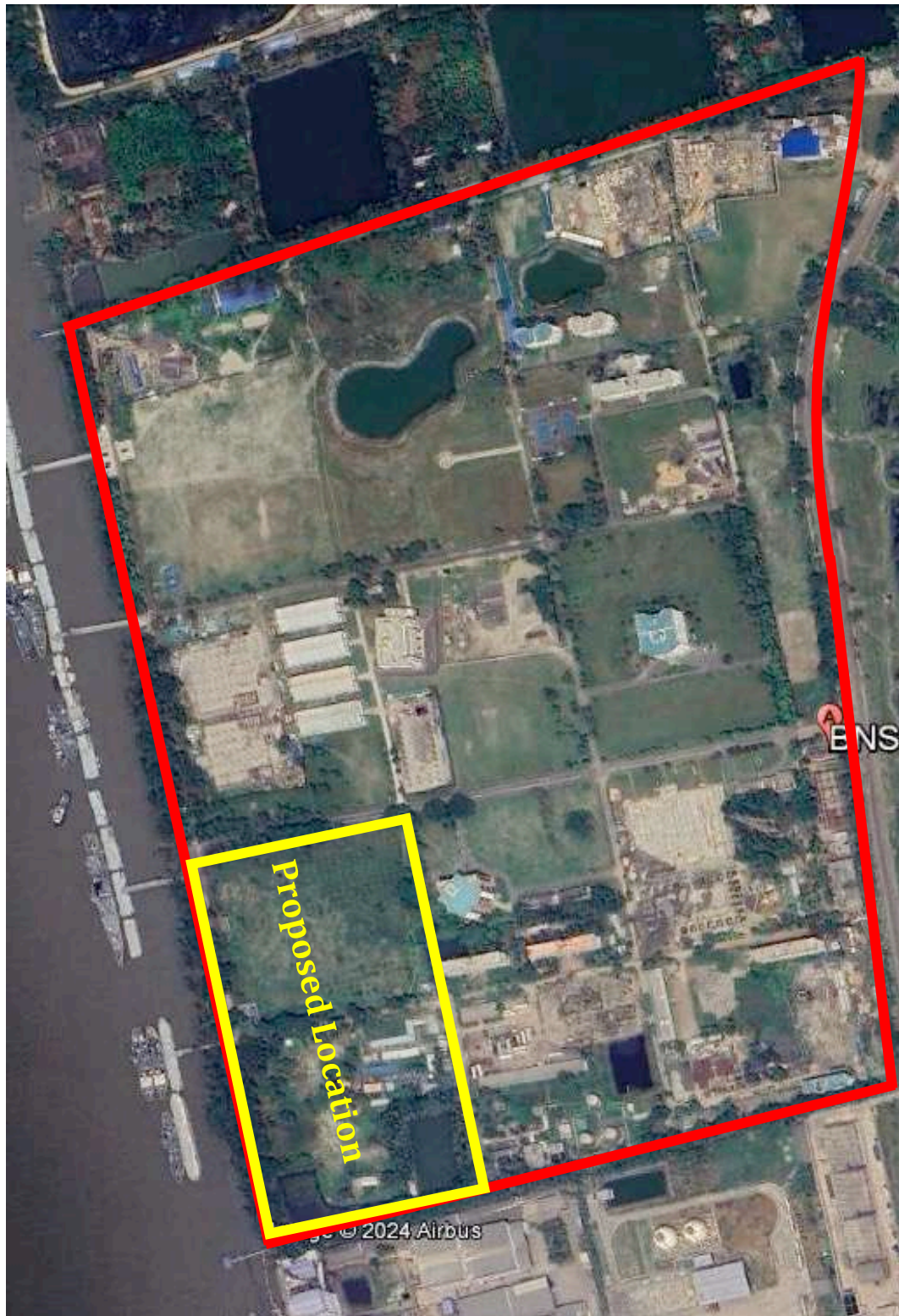
Fig. 1.3 Details of the proposed location at MONGLA