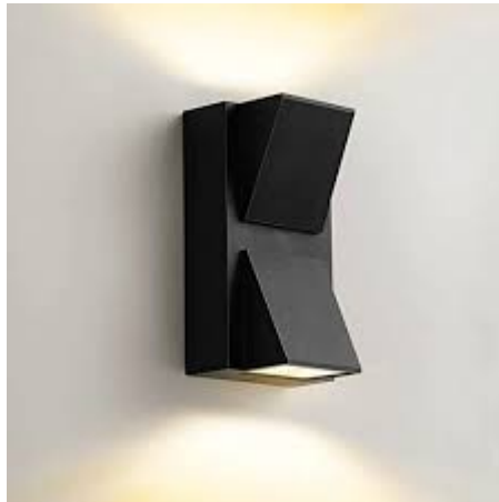
Fig: LED top down outdoor light