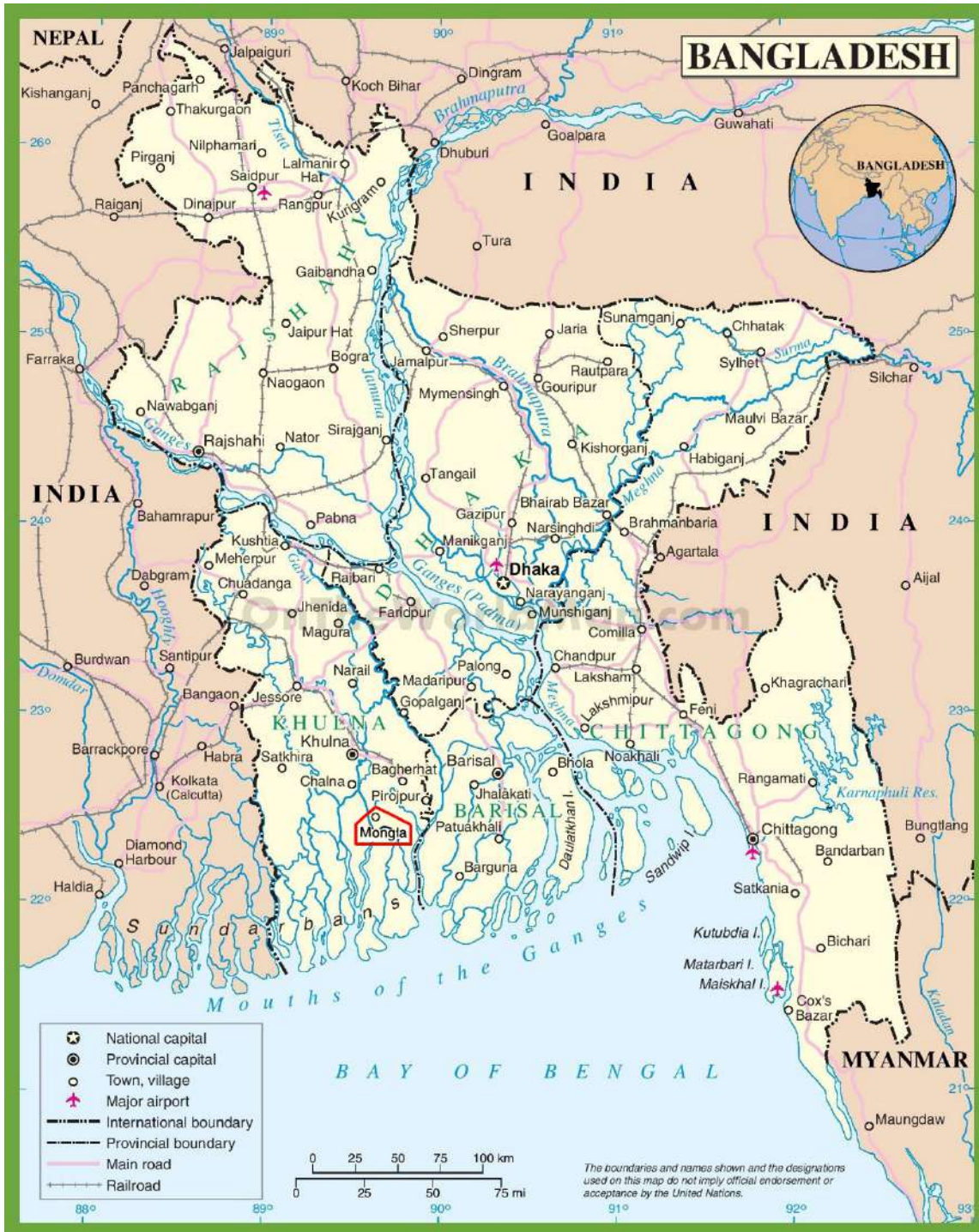
Fig. 1.1 Map of Bangladesh.