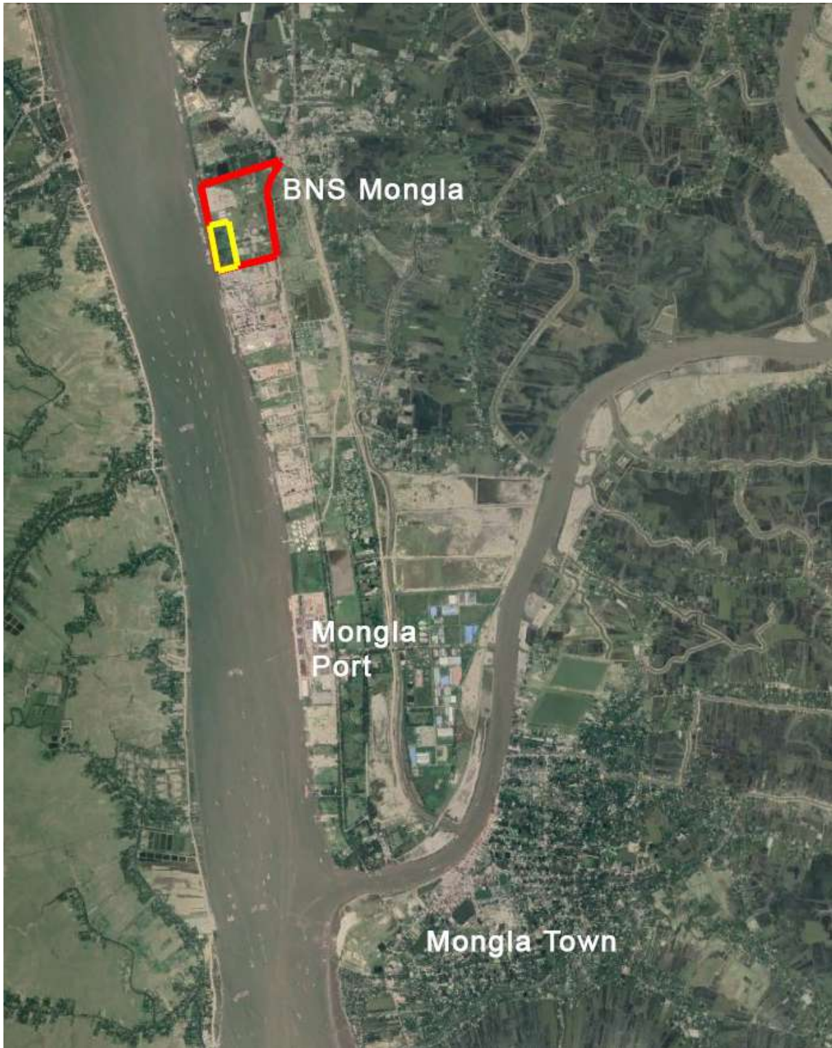
Fig. 1.2 Location of MONGLA