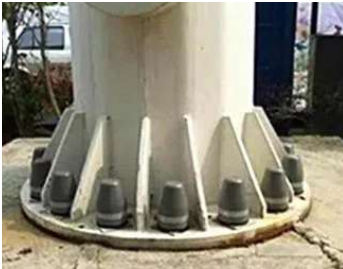
Fig: Typical footing including base plate and anchor bolt

The thimbles shall be secured on ropes by compression splices. Two continuous lengths of stainless-steel wire ropes shall be used in the system and no intermediate joints are acceptable in view of the required safety. No intermediate joints, either bolted or else is provided on the wire ropes between winch and lantern carriage.